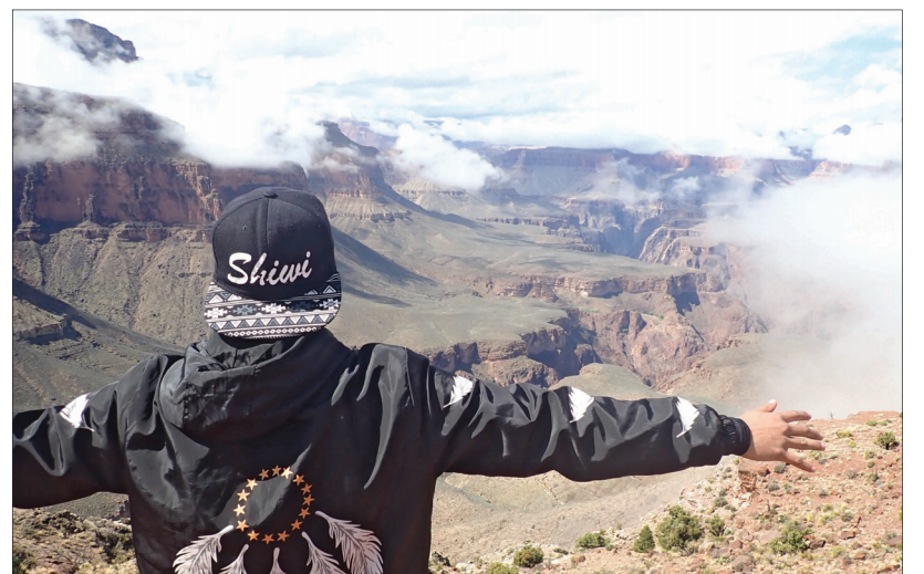
Six Zuni youth spent three days hiking and exploring their cultural ties and connections to the Grand Canyon through the Zuni Youth Enrichment Program.