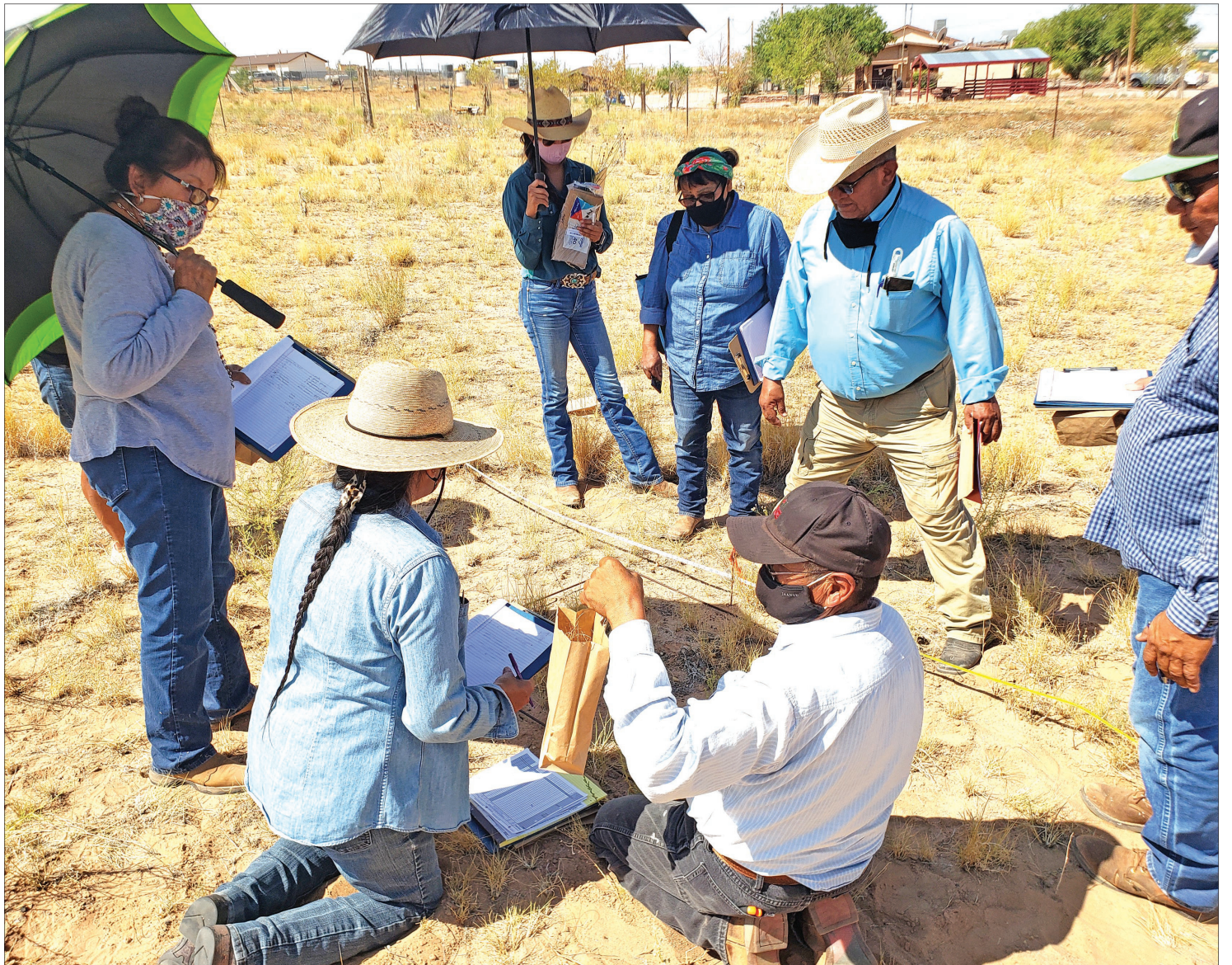
Members of the Tolani Lake Livestock and Water Users Association gather for a workshop in late August to learn how to evaluate range conditions in order to provide a more successful livestock operations.