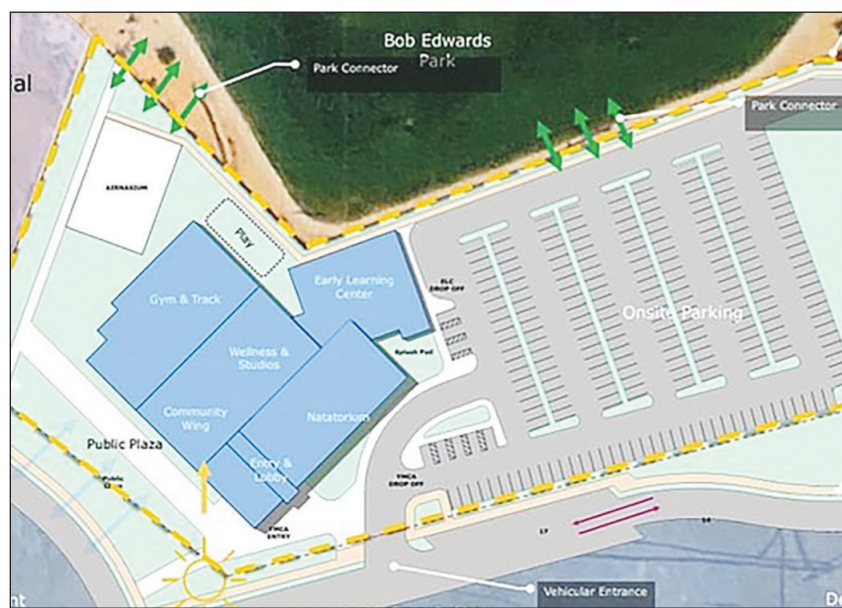
An artist's rendering of the site plan for a YMCA in Prescott Valley, at the southwest corner of North Viewpoint and East Long Look drives.

During that time, the Fain Signature Group committed 7.2 acres near the southwest corner of North Viewpoint and East Long Look drives for the project. Of those 7.2 acres, 5