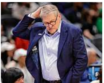
UConn head coach Geno Auriemma reacts to the Huskies' 73-61 loss to Ohio State in the Sweet 16.

The end to this season of turmoil came with a loss defined UConn women continues on A8