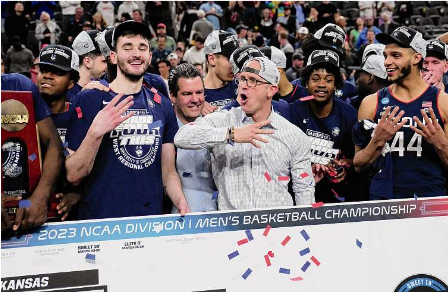
UConn head coach Dan Hurley, middle, celebrates with his team after the Huskies defeated Gonzaga 82-54 Saturday to win the West Region final and reach the NCAA's Final Four for the fifth time.