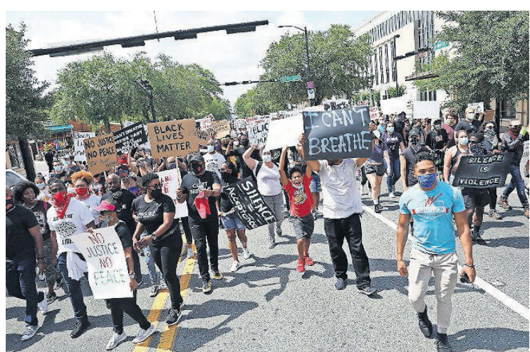
Protesters make their way up Main Street in Gainesville on May 30 as they take part in a march in response to the killing of George Floyd by a police officer in Minneapolis. Even peaceful protests like this could result in felony charges for blocking traffic under legislation proposed by Gov. Ron DeSantis on Monday.