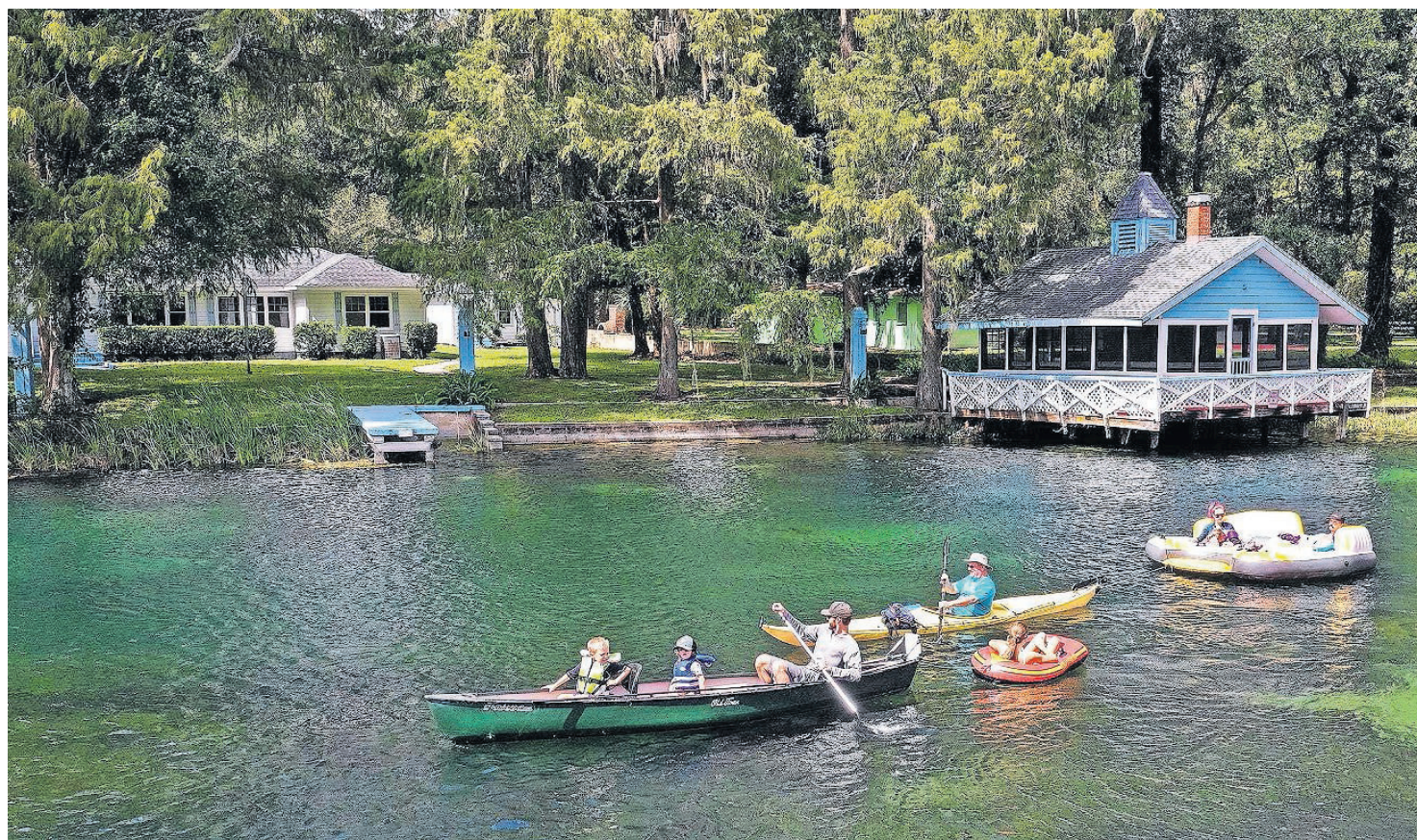
Tubers, kayakers and a family in a canoe make their way down the Rainbow River on Monday. The state recently earmarked more than $13 million for projects designed to benefit the Rainbow and Silver Rivers.