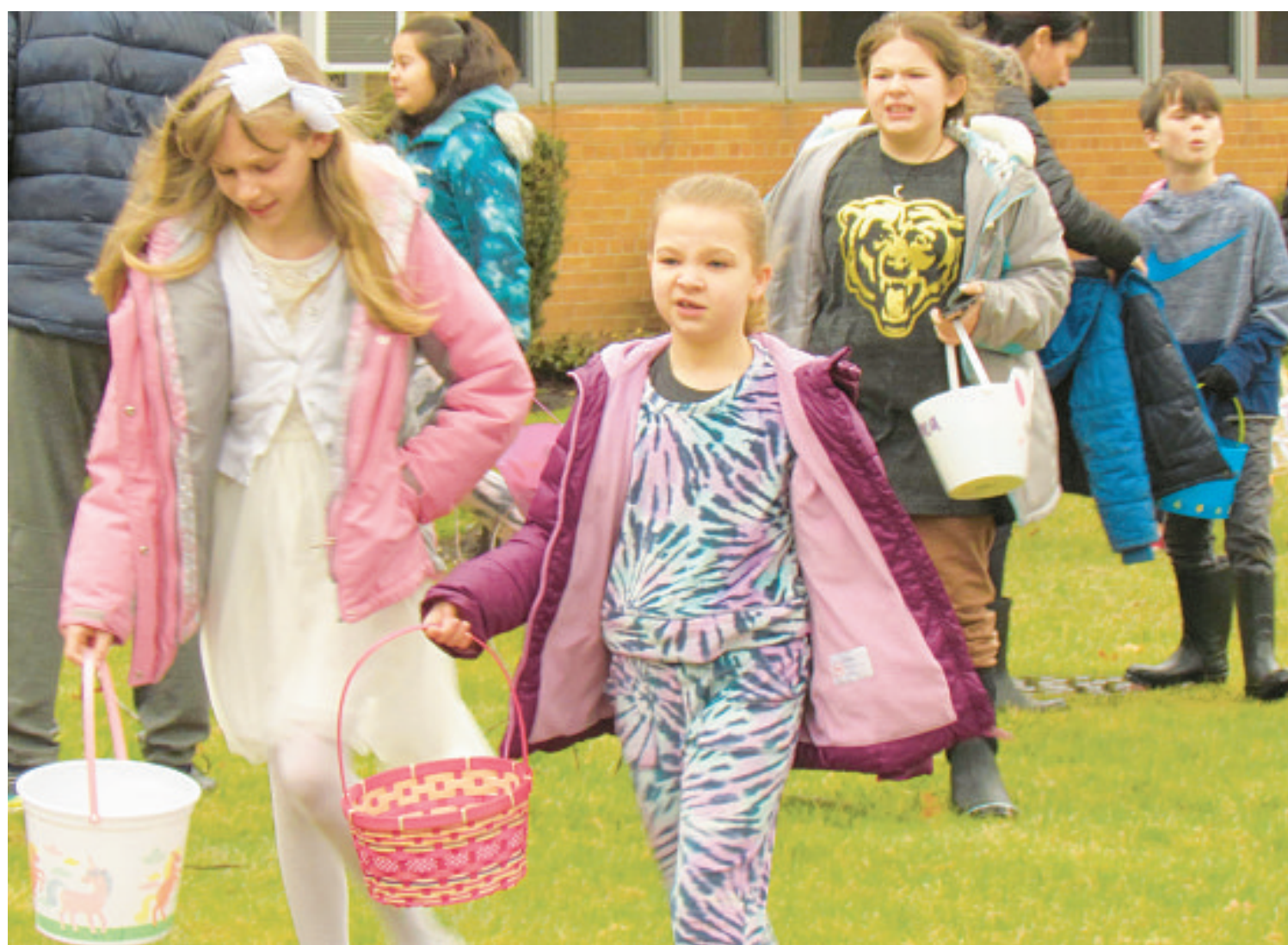
Despite the chilly weather, plenty of young people took part in the Easter Egg Hunt at Rosary High School in Aurora on Saturday.