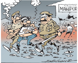
Not me, sir... detain all political leaders to control riots!