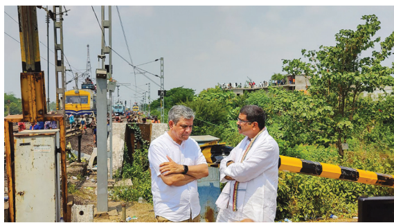
Union ministers Ashwini Vaishnaw and Dharmendra Pradhan take stock of the ongoing restoration work at the accident site in Balasore on Sunday.

"It happened due to a change made in the electronic interlocking and point machine," Mr Vaishnaw told reporters