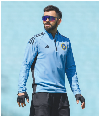
Virat Kohli during a practice session ahead of the World Test Championship final against Australia from June 7 at the Oval Stadium in London on Sunday.