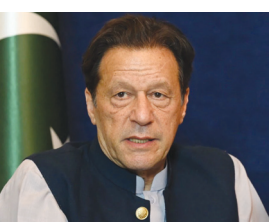
Imran Khan while responding to a question if the deposed premier could be prosecuted under the Army Act. His remarks came days

Mr Khan, 70, could stand trial in a military court if evidence of his involvement in the May 9 violence surfaced in the coming days, Mr Asif was quoted as saying by The Express Tribune newspaper. He also confirmed that no case had been registered against the Pakistan Tehreek-e-Insaf chief so far in connection with the May 9 attacks. "Definitely...there are chances that Imran Khan can be tried in a military court," the minister said