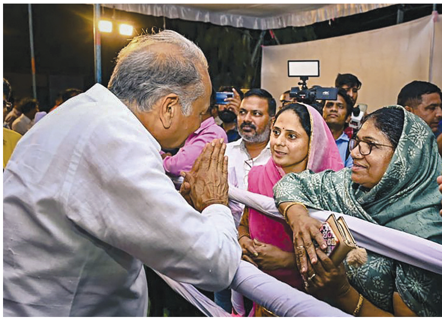
Rajasthan chief minister Ashok Gehlot interacts with Congress workers in Pali on Saturday.