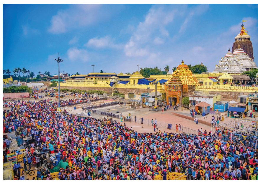
A large crowd gathers at the Lord Jagannath temple for the grand bathing rituals on the occasion of Deba Snana Purnima in Puri on Sunday.

Indian Railways, Mr Kharge asked why these posts have not been filled in the last nine years. The Congress president said that posts at high levels whose recruitment is through the Prime