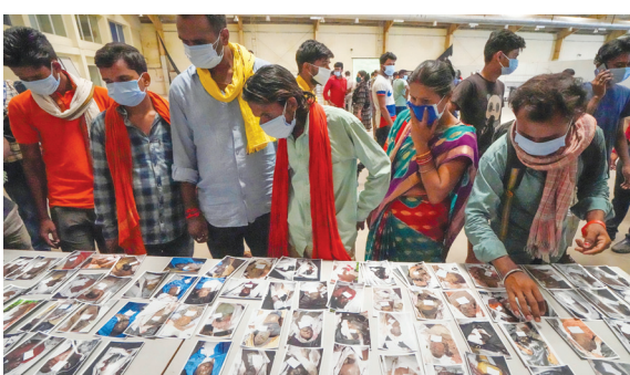
Relatives identify photos of the passengers, displayed by the authorities, following Friday's accident in Balasore district on Sunday.

Days after the Odisha rail tragedy, Congress president Mallikarjun Kharge on Sunday alleged that Prime Minister Narendra Modi was busy flagging off trains while not paying attention to railway safety and called for fixing the accountability of all posts from top to bottom to prevent such incidents in the future. The Congress party also demanded the resignation of railway minister Ashwini Vaishnaw over the rail tragedy and alleged that his "PR gimmicks" overshadowed the "serious deficiencies, criminal negligence and complete disregard for safety and security" of Indian Railways.