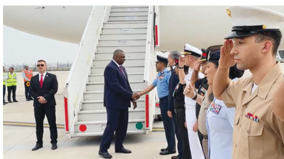
US secretary of defence Lloyd Austin arrives in New Delhi on Sunday.

The Congress, after the meeting of Mr Pilot and Mr Gehlot with party president Mallikarjun Kharge and Rahul Gandhi in Delhi, had said the two leaders have agreed to the party's "proposal" and will fight the upcoming Assembly elections unitedly, leaving all issues to be resolved by the high command. ■ Turn to Page 4