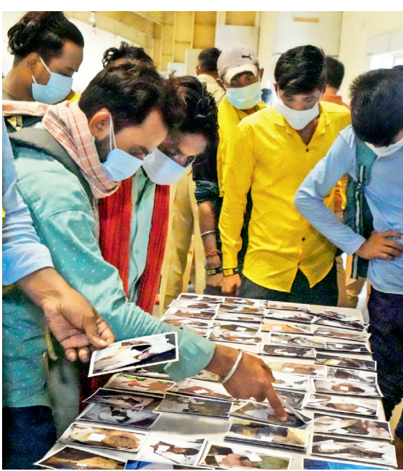
Relatives try to identify photos of passengers on display at the NOCCI Business Park, Balasore on Sunday.

The railways on Sunday virtually ruled out driver error and system malfunction, indicating possible "signalling interference" and hinting at "sabotage" and tampering of the electronic interlocking system behind the triple train accident that claimed 275 lives in Odisha. Railway minister Ashwini Vaishnaw said that the root cause behind the tragic train mishap has been ascertained and sought a CBI inquiry into the accident. "It happened due to a change made in the electronic interlocking and point machine," Vaishnaw said. "We've identified the root cause of the train accident and the people responsible for it. The accident happened due to a change in electronic interlocking. Right now our focus is on restoration," Vaishnaw tweeted. "Our target is to finish the restoration work by Wednesday morning so that trains can start running on this track," Vaishnaw said. Dispelling media reports and theories, the railway board made some startling