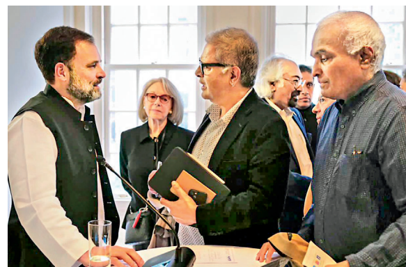
Congress leader Rahul Gandhi during an event at the Roosevelt House, home of former US president Franklin D. Roosevelt, in New York, USA on Saturday.

Congress leader Rahul Gandhi on Sunday said that the party would defeat the "hated-filled ideology" of the BJP and decimate it in the Assembly polls in Telangana and other states. "It will be hard to find the BJP in Telangana after this election," he said. "They tried everything in the book. They have the media with them. They had ten times the amount of money we had. They had the government, they had the agency. But we just did not defeat them. We smashed them in Karnataka." Rahul Gandhi said at a dinner hosted by the Indian Overseas Congress-USA in New York. "We are going to decimate them in Telangana next. It will be hard to find the BJP in Telangana after the elections. The people