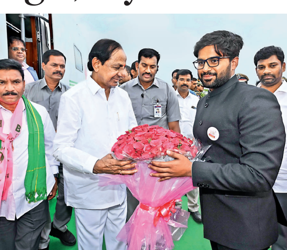
Chief Minister K. Chandrashekar Rao being welcomed before inaugurating the Integrated District Collectorate Complex in Nirmal on Sunday.

Chief Minister K. Chandrashekar Rao called upon people to throw the Congress into "Bangalokatham (Bay of Bengal)" — where it said it would throw Dharani portal if it is voted to power in the upcoming Assembly elections. Focusing the meeting on the Dharani portal, he warned the people that if the Congress came to power in Telangana, it would welfare schemes. "They will say 'Ram Ram' to Rythu Bandhu and 'Jai Bheem' to Dalit Bandhu," the CM remarked to loud applause from the gathering at a public meeting in Nirmal on Sunday. He had earlier inaugurated the BRS district office and integrated district collectorate complex and laid the foundation stone for the government medical college and formally inaugurated 2,000 2BHK units. Despite a drizzle, the meeting began on schedule.