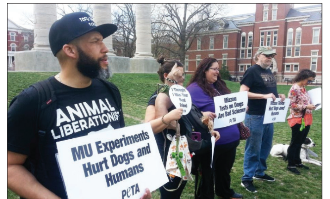
A group of protesters representing People for the Ethical Treatment of Animals assembles at Francis Quadrangle on the University of Missouri campus Tuesday.