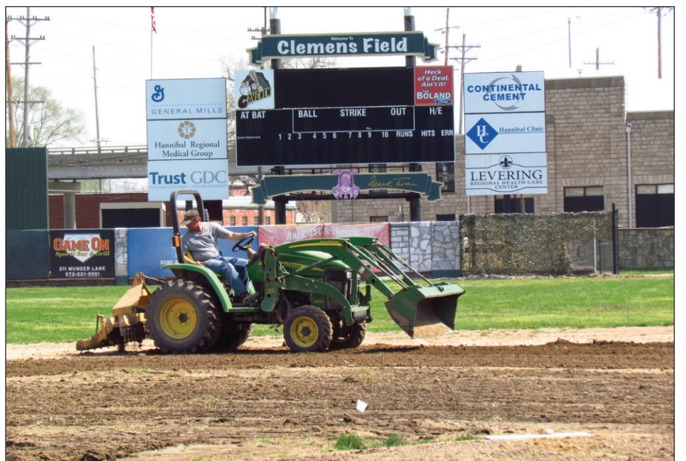
Earth work was underway Thursday morning on the infield of Clemens Field in Hannibal.

NEED MORE INFORMATION? Contact us at: PHONE (573) 221-2800 E-MAIL newsroom@courierpost.com