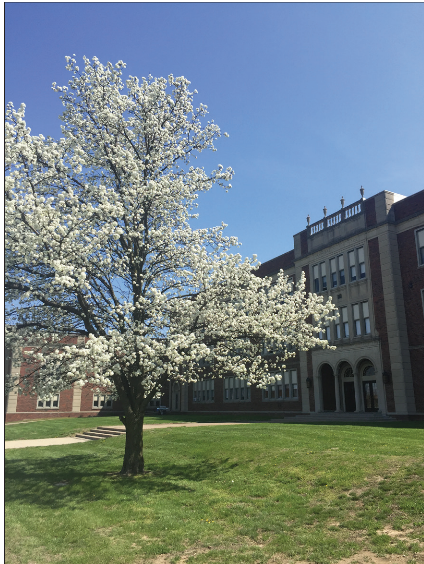
The tree in front of Hannibal High School is in full bloom, just in time for Friday, April 27, which is Arbor Day.