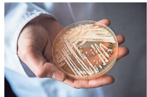
The yeast candida auris can cause serious blood infections and is difficult to diagnose and treat.