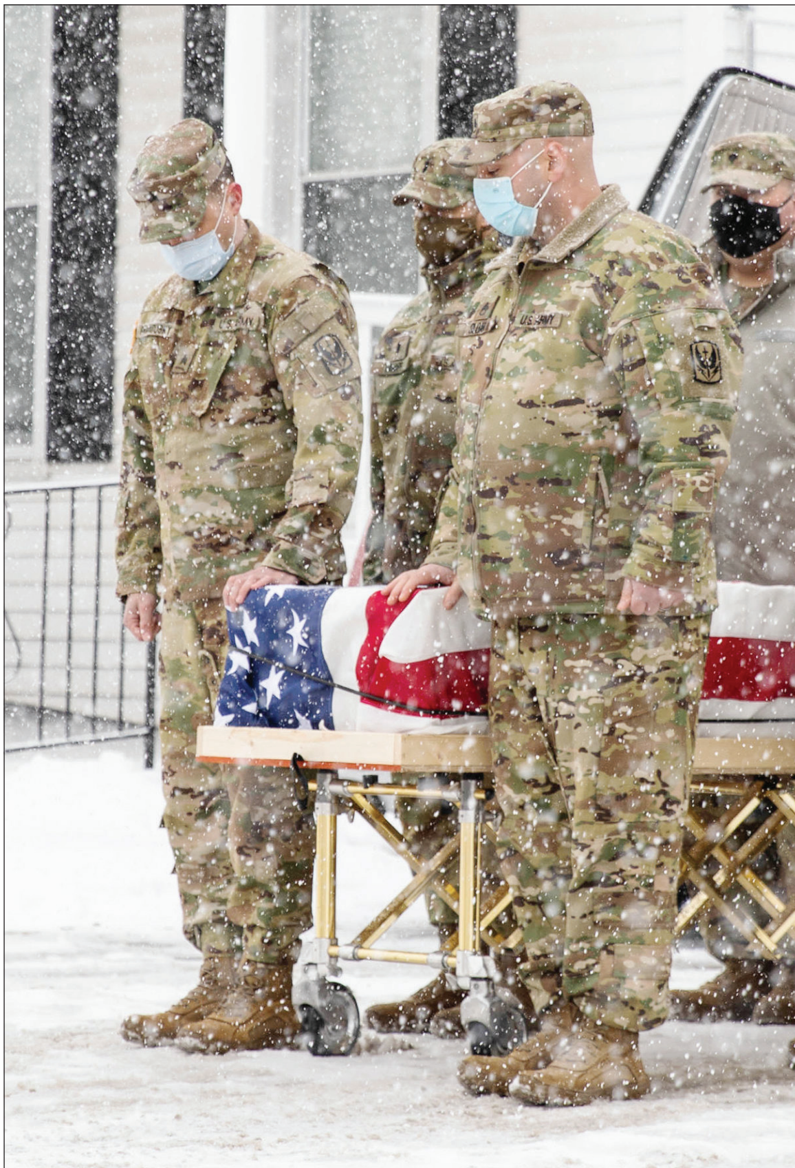
The remains of two of three National Guardsmen killed in a Western New York helicopter crash last week are removed from a hearse Tuesday at Hart & Bruce Funeral Home on South Massey Street where they'll be prepared for burial.