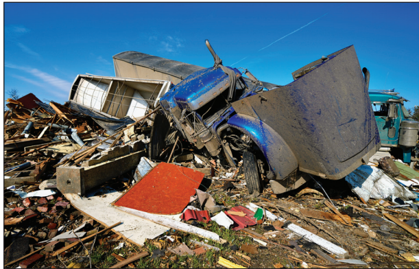
Two semis are seen bunched up, Sunday, March 26, 2023, in Rolling Fork, Miss., after they were moved by a tornado two days earlier.