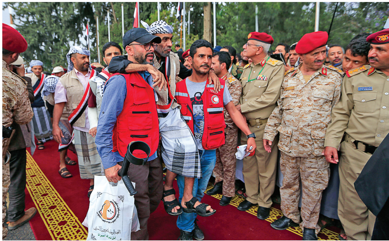
A Yemeni prisoner is carried by medics upon his arrival at Sanaa airport on Friday

It also expressed its support for reaching a political solution to the crisis in Syria that preserves the country's territorial unity, security and stability, supports Syrian state institutions assuming control over all of the republic's lands in a manner that achieves security and stability in the region, as well as the welfare and prosperity of the brotherly people of Syria.