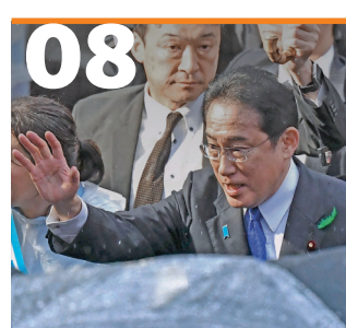
Japan PM resumes campaign after blast

The country witnessed 6,628 recoveries in that 24-hour period, which led total recoveries to 4,42,23,211, while the recovery rate currently stands at 98.69 per cent, the bulletin stated.