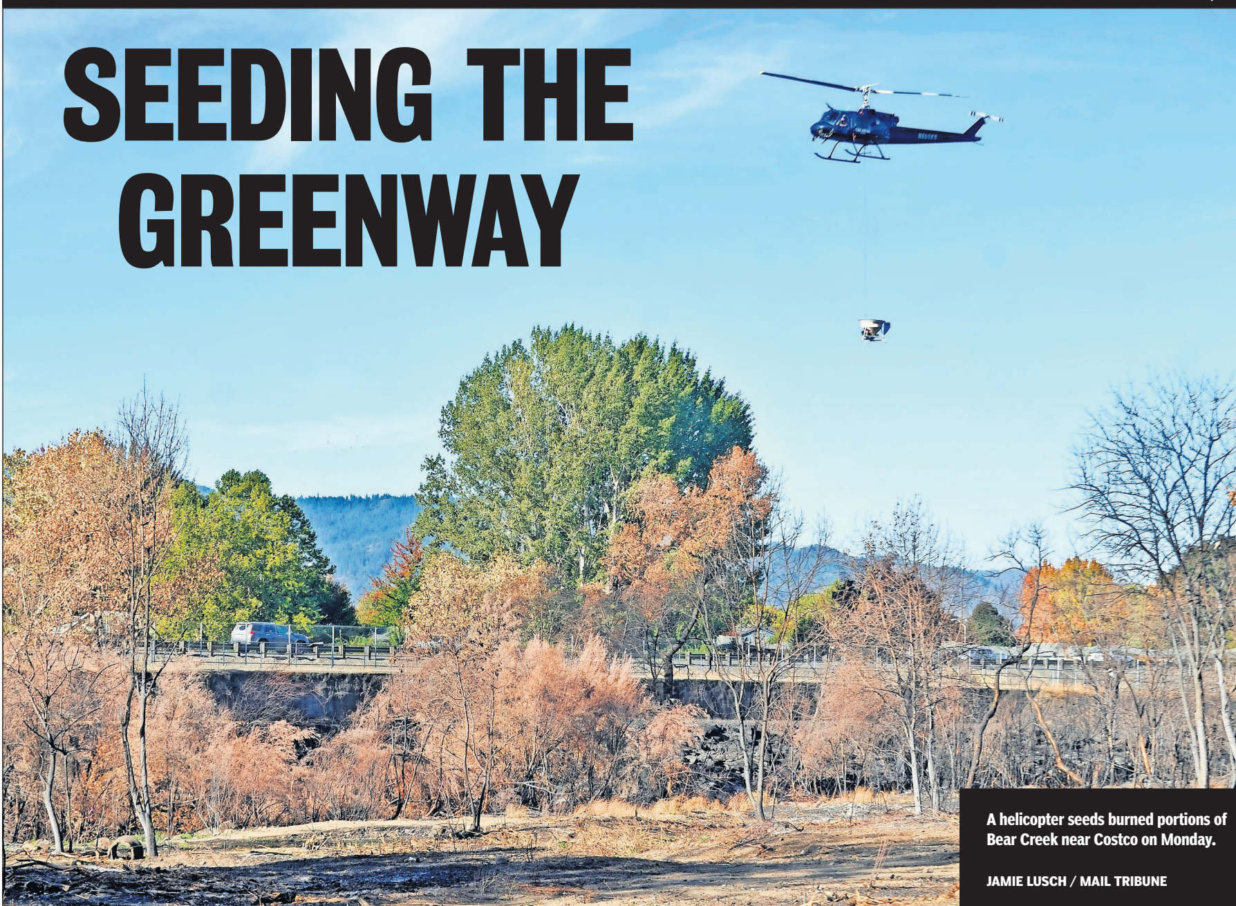
A helicopter seeds burned portions of Bear Creek near Costco on Monday.