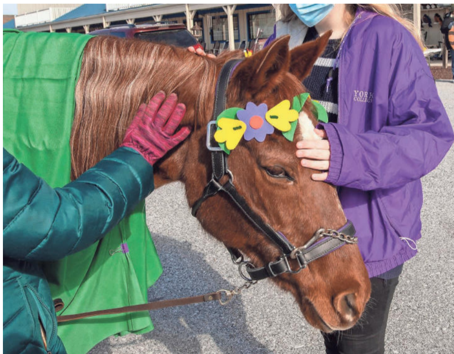
A 37-year-old horse named My Lucky Penny stands in for the national horse mascot named Hope during the drive-through Cookie Rally.