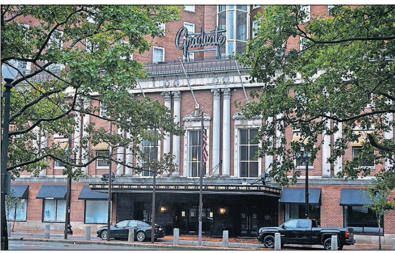
The Graduate Providence hotel, closed during the pandemic, has not announced a reopening date.